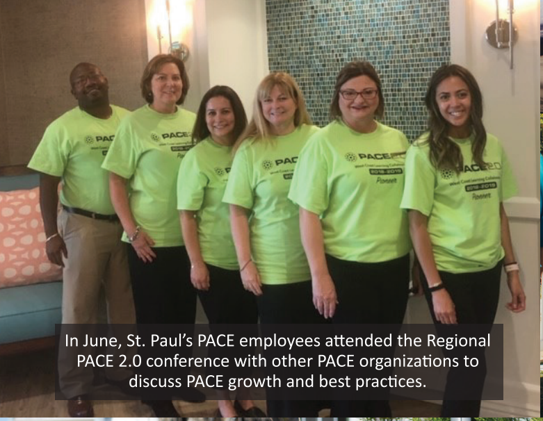
In June, St. Paul's PACE employees attended the Regional PACE 2.0 conference with other PACE organizations to discuss PACE growth and best practices.