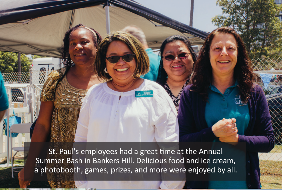
St. Paul's employees had a great time at the Annual Summer Bash in Bankers Hill. Delicious food and ice cream, a photobooth, games, prizes, and more were enjoyed by all.