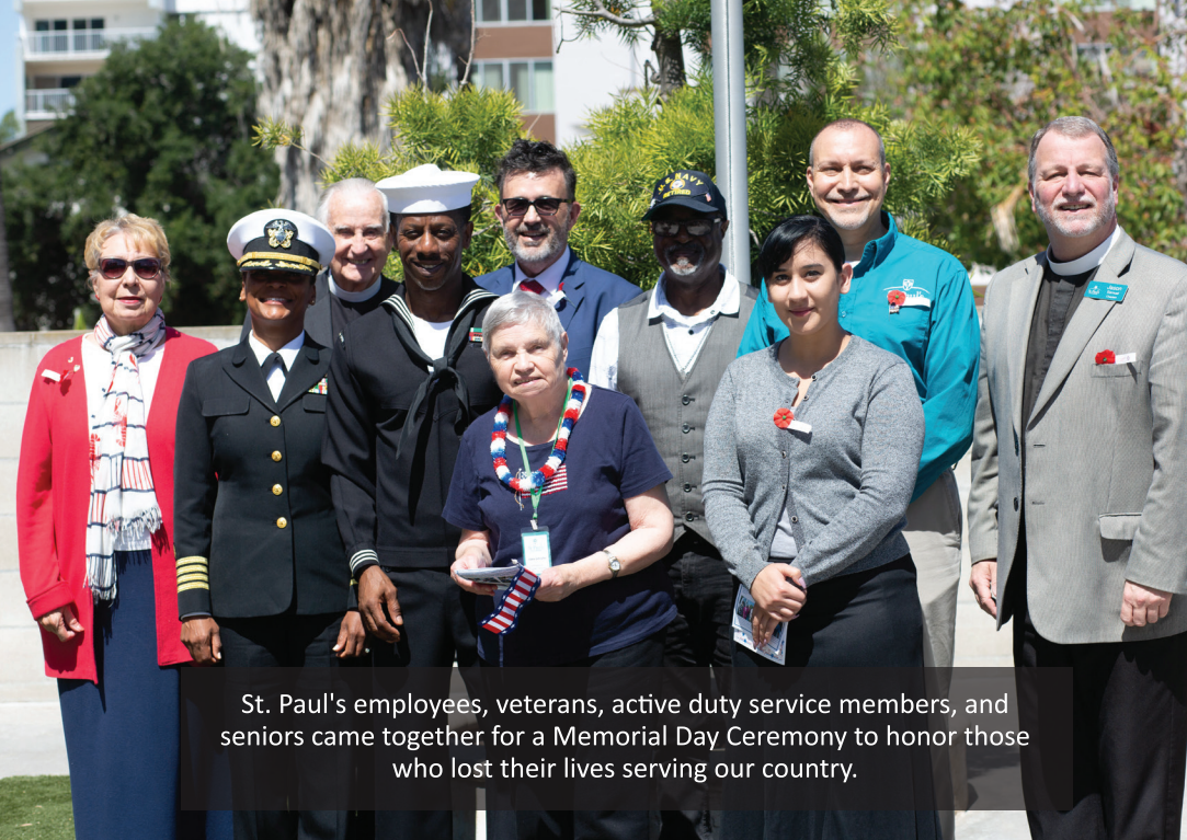
St. Paul's employees, veterans, active duty service members, and seniors came together for a Memorial Day Ceremony to honor those who lost their lives serving our country.