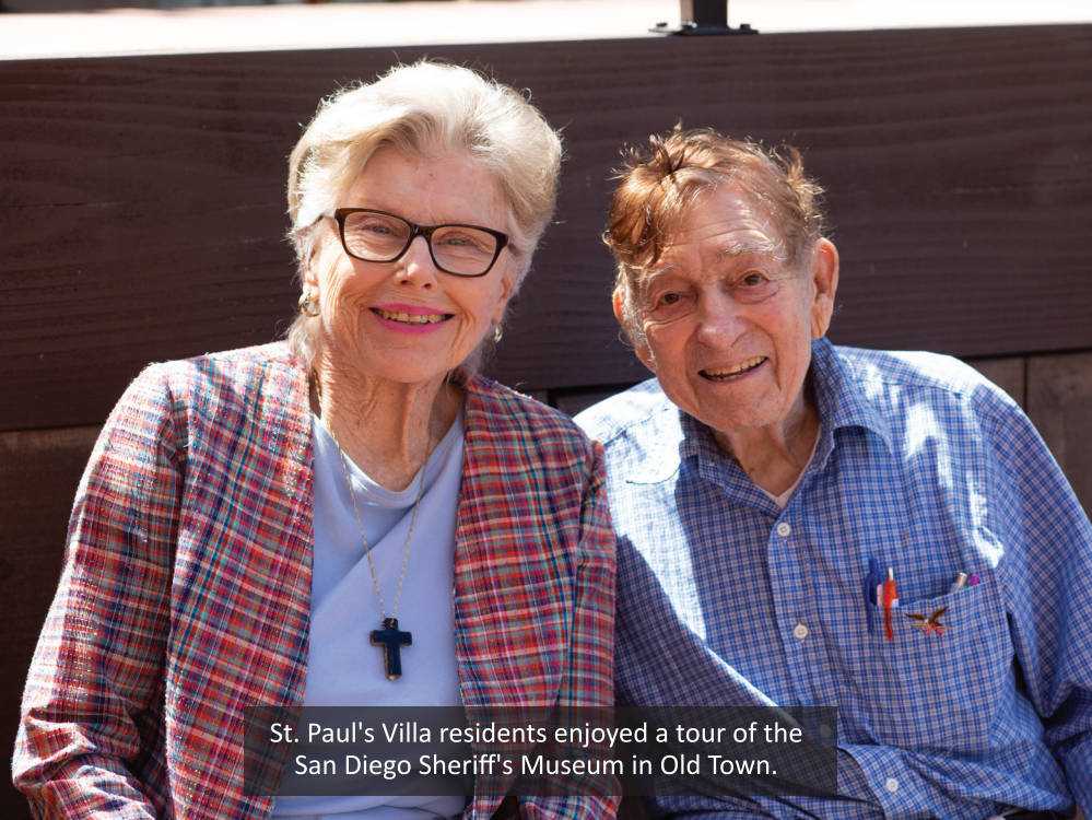
St. Paul's Villa residents enjoyed a tour of the San Diego Sheriff's Museum in Old Town.