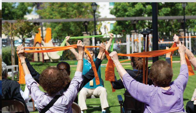
St. Paul's Annual Senior and Family Resource Fair was a huge success; our largest yet. Held on Senior Health and Fitness Day, it included an Interactive Wellness Pavilion, a presentation on mental wellness as we age, and more. KUSI-TV brought us in-studio to preview the event and invite the community to attend.