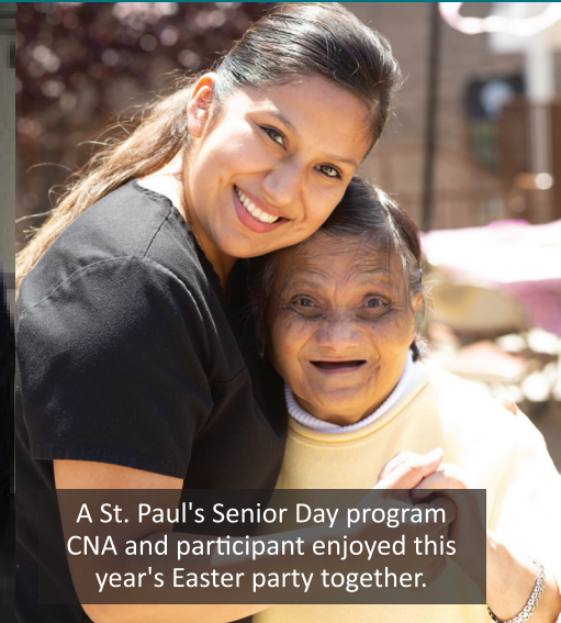
A St. Paul's Senior Day program CNA and participant enjoyed this year's Easter party together.