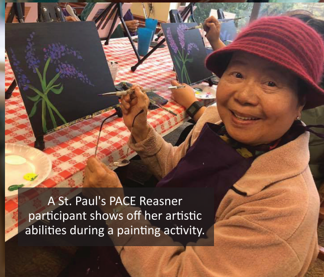
A St. Paul's PACE Reasner participant shows off her artistic abilities during a painting activity.