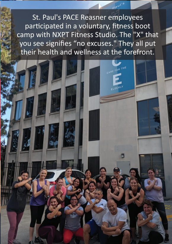
St. Paul's PACE Reasner employees participated in a voluntary, fitness boot camp with NXPT Fitness Studio. The "X" that you see signifies "no excuses." They all put their health and wellness at the forefront.