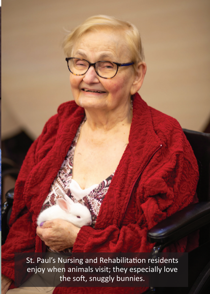
St. Paul's Nursing and Rehabilitation residents enjoy when animals visit; they especially love the soft, snuggly bunnies.