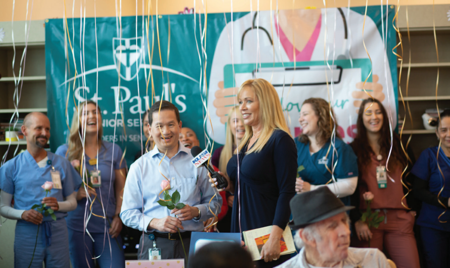
St. Paul's honored their nurses at St. Paul's PACE El Cajon with a huge celebration, and KUSI-TV was there to share the pride we have in our nursing staff with San Diego.