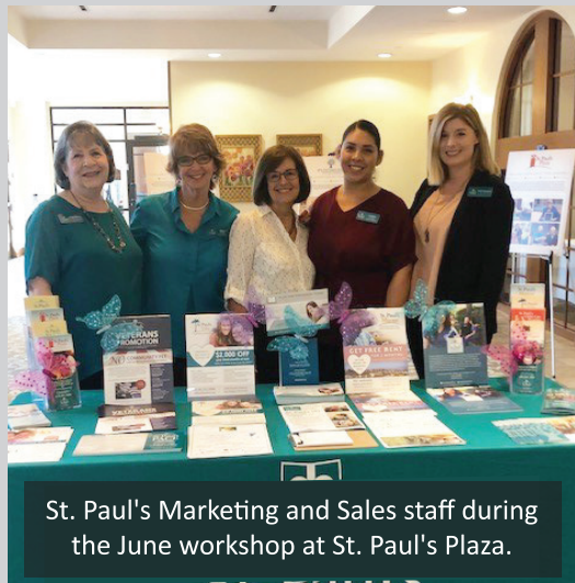
St. Paul's Marketing and Sales staff during the June workshop at St. Paul's Plaza.

St. Paul's has successfully hosted three workshops in their "Plan for Tomorrow, Today" Educational Series. So far, the series has covered topics such as Planning Ahead, Financial and Estate Planning, and Living and Care Options.