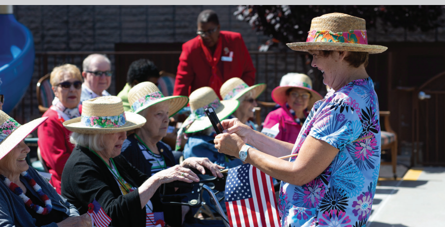
St. Paul's annual Memorial Day Ceremony was well attended and was featured by CBS News 8.