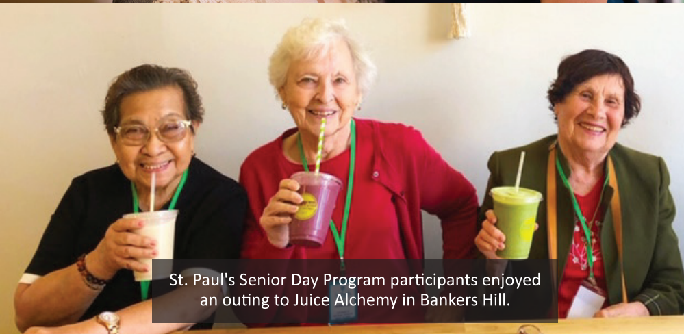
St. Paul's Senior Day Program participants enjoyed an outing to Juice Alchemy in Bankers Hill.