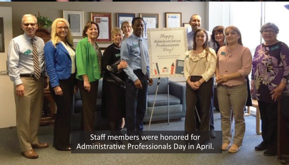
Staff members were honored for Administrative Professionals Day in April.