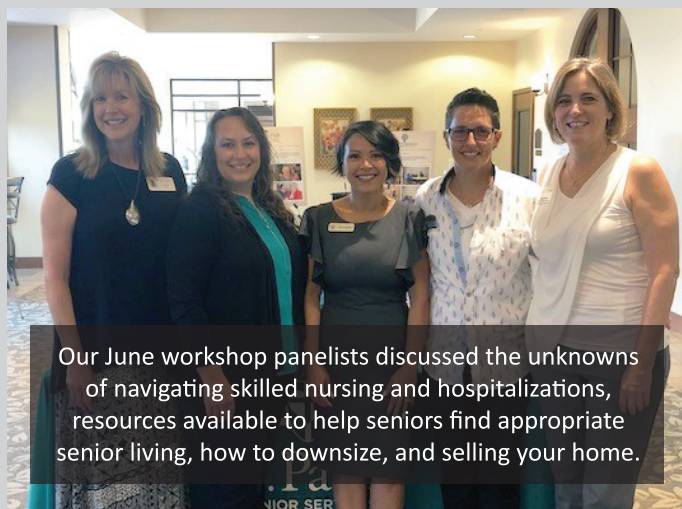
Our June workshop panelists discussed the unknowns of navigating skilled nursing and hospitalizations, resources available to help seniors find appropriate senior living, how to downsize, and selling your home.

St. Paul's sales and marketing staff were inspired to launch this educational series after receiving countless phone calls from seniors and family caregivers in crisis who had no plan for their future and no idea where to start. With these people in mind, St. Paul's created this series to help the aging population prepare for what's ahead. Other topics include finances, insurance, hospitalizations, memory concerns, downsizing, end-of-life wishes, and more.