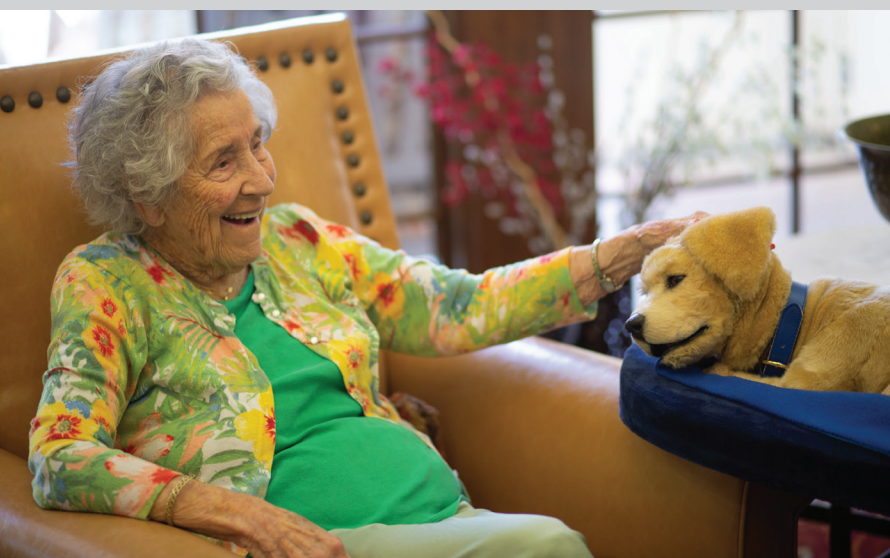
Tombot, a robotic dog company, visited St. Paul's Plaza with their prototype dog, Jenni, for residents to experience. This product is being created for those who can't care for a real dog but would benefit from a companion, such as those with Alzheimer's and dementia. CBS News 8 was there to cover the story.