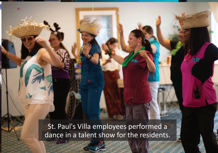
St. Paul's Villa employees performed a dance in a talent show for the residents.